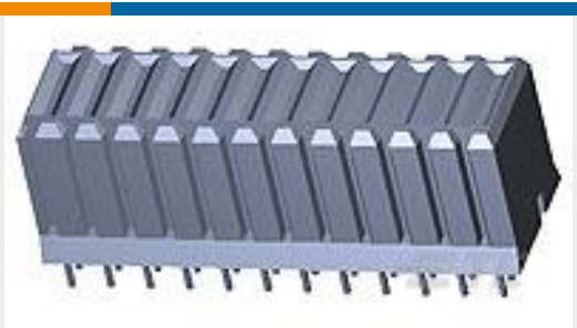
TE Part #120953-4 UPM EXPANDED RCPT ASSEMBLY