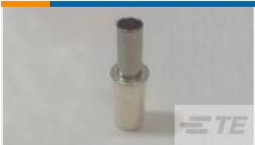
TE Part #6648317-1 CONTACT,SOCKET,SIZE #8