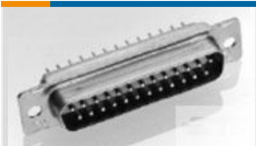
TE Part #1757820-1 AMPLIMITE,ASY,RCPT,STD,109,ZN,1