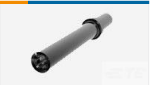
TE Part #1648325-1 702-92-01109=CONTACT,SKT,#20