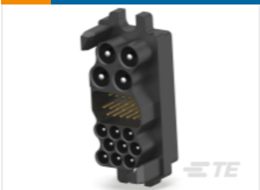
TE Part #6643425-1 CONN,PIN,75Amp MIDDLE DWR