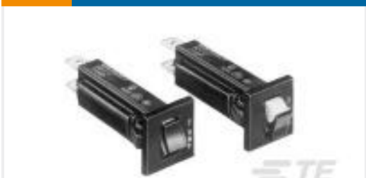
TE Part #6-1393250-5 W28-XT1A-15=W28