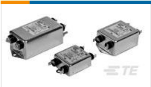
TE Part #1-1609034-5 10VSB1=F8331