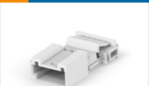
TE Part #2-968696-3 4POS MQS TAB COD B