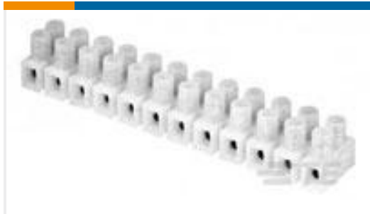
TE Part #1-1776294-2 TSB23012=EUROPA TERM BLK,8MM